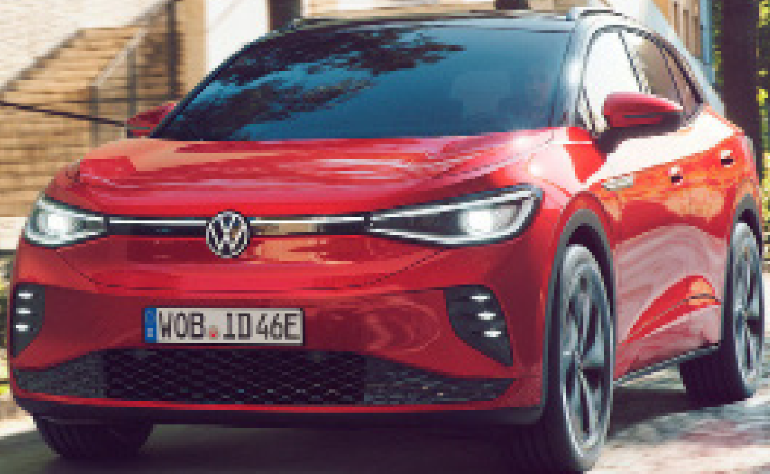
Image shows ID.4 GTX