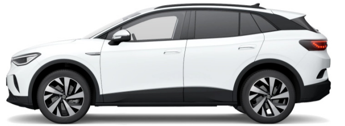
Glacier White Metallic 1 2Y2Y