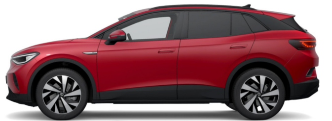
King's Red Metallic 1 P8P8