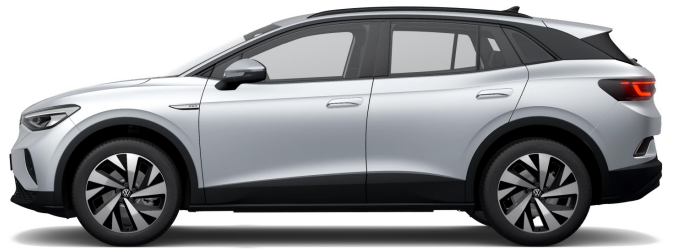
Scale Silver Metallic 1 1T1T