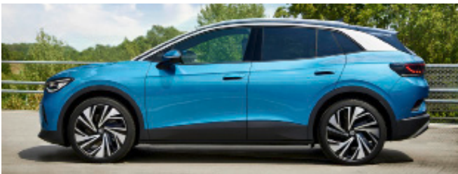
Costa Azul Metallic 1,2 3K3K

1 Optional at extra cost · 2 Not available on GTX models Note: All paints (with the exception of Grenadill Black Metallic) can add a black exterior roof with the optional extra Bi-Colour Styling Package Please note, the print processes do not allow exact reproduction of the paint colours.