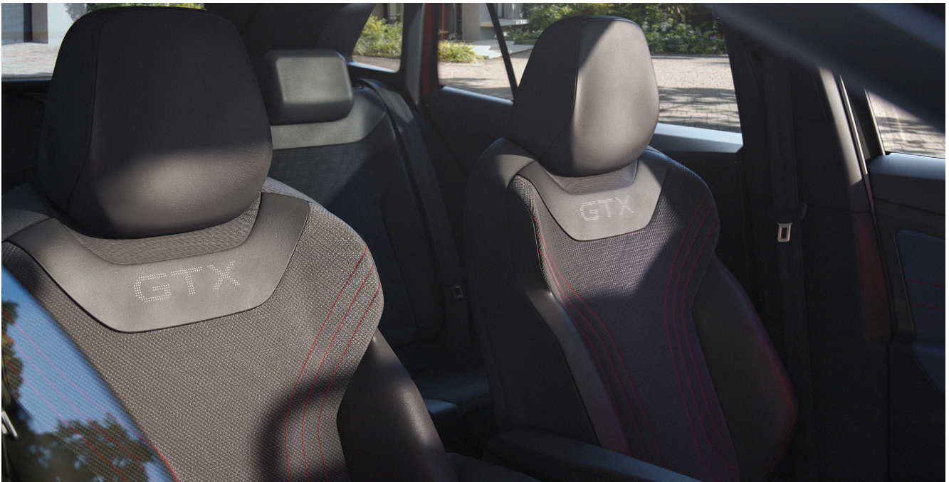
GTX Cloth/Leatherette Soul/Flash Red Standard on ID.4 GTX

Note: Some parts of leather interior trim will contain artificial leather. Note: The print processes do not allow exact reproduction of the upholstery & insert colours.