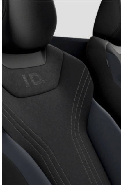
Artvelours Microfleece/Leatherette Soul/Platinum Grey Standard from ID.4 PURE PLUS / PRO PLUS Optional on ID.4 PURE / PRO Electric controls are available via the addition of the Interior Plus Package