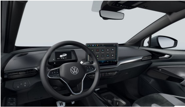
Standard from ID.4 PURE / PRO