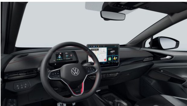
Standard on ID.4 GTX