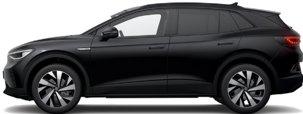
Grenadill Black Metallic 1 0E0E