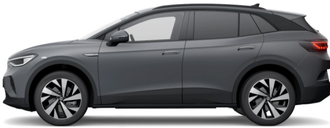
Moonstone Grey Solid C2C2