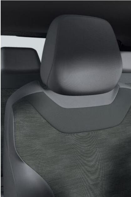
Fabric 'Matrix' Soul/Platinum Grey Standard from ID.4 PURE / PRO