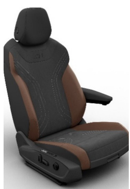
Artvelours Microfleece/Leatherette Soul/Florence Brown Standard from ID.4 PURE PLUS / PRO PLUS Optional on ID.4 PURE / PRO Electric controls are available via the addition of the Interior Plus Package