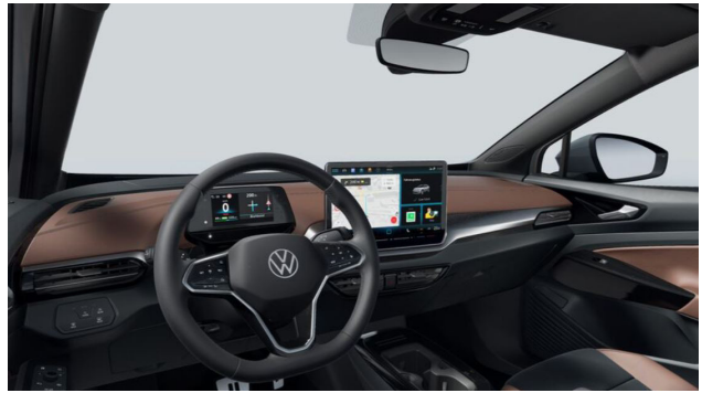
Standard selection from ID.4 PURE PLUS / PRO PLUS