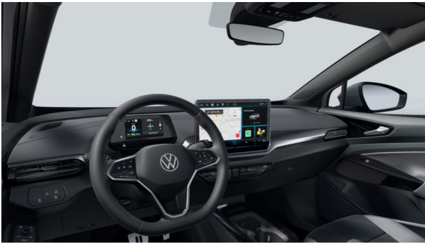
Standard from ID.4 PURE PLUS / PRO PLUS